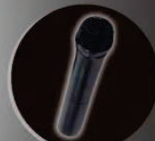
Wireless Microphone Included