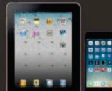
Compatible with iPhone, iPad, iPod, Android and more...