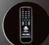
Remote Control Included