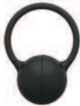
Item-No.: 50041 EAN: 4041166500412