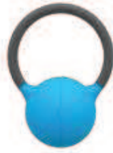
Item-No.: 50036 EAN: 4041166500368