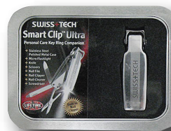
Metal Gift Box with Window Lid