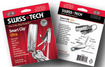
Environmental Clamshell Packaging