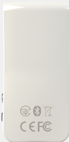
nio Tag certifications

nio Tag is fully certified for global sale. Bluenio is also a registered member of the Bluetooth SIG.