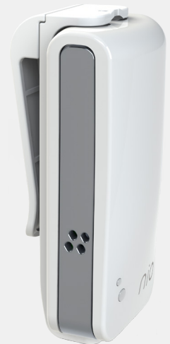
nio Tag with detachable clip

The robust clip makes attaching your nio Tag quick and easy. The clip is ideal for placing on a bag, belt, or other item of clothing.