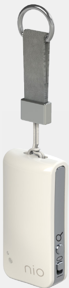
nio Tag with detachable lanyard

The leather lanyard is ideal for attaching the nio Tag to your key-chain, luggage, or any other item where you want to be sure the Tag cannot easily be removed.