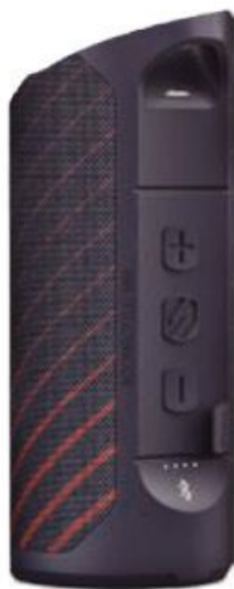
Black w/ red Stripe