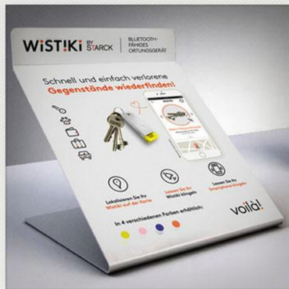
250x250x250mm Typ: PLV R