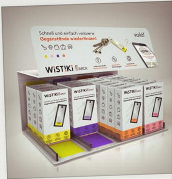
Typ: PLV H