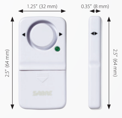
Depth: 0.6" (15 mm)