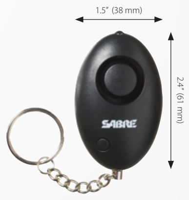
Depth: 0.8" (20 mm)